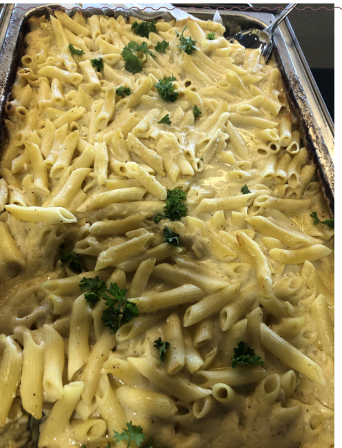
Three Cheses Mac & Cheese