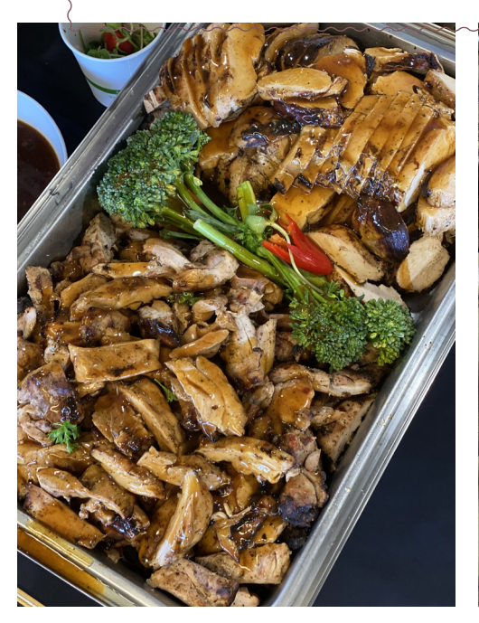
Grilled Chicken Thign and Chicken Breast with Homemade Teriyaki Sauce

Tossed Green Salad (GF BBQ Baked Beans Three Cheeses Mac & Cheese Sweet Rolls breads with butter 35.95