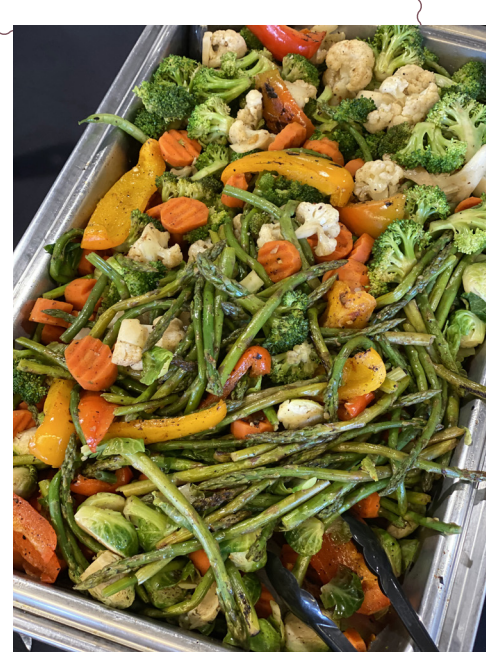
Grilled Veggie Medley